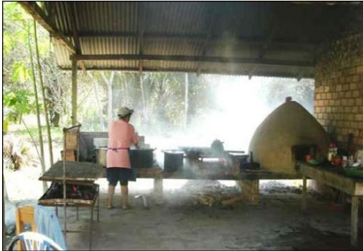
The air-conditioned kitchen.