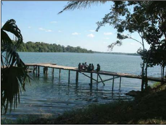
Best place for a discussion.

You recall that I experienced horrific stomach pains in my flight from Miami to La Paz. Perhaps that was the prelude to my second night at TEC. I had never been so sick in my life. This was compounded by my overly conscientious bent. Lord, how could this be! Not the right time. I have my load to carry! My companions, however, were truly compassionate and accommodating.