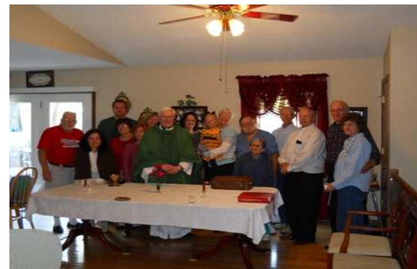
The Spirit of St. Louis TEC community celebrated their 5th anniversary with Mass, good food and camaraderie.